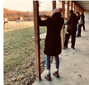
This year with target shooting

Starting at 11:00am in the GERMANIA PARK